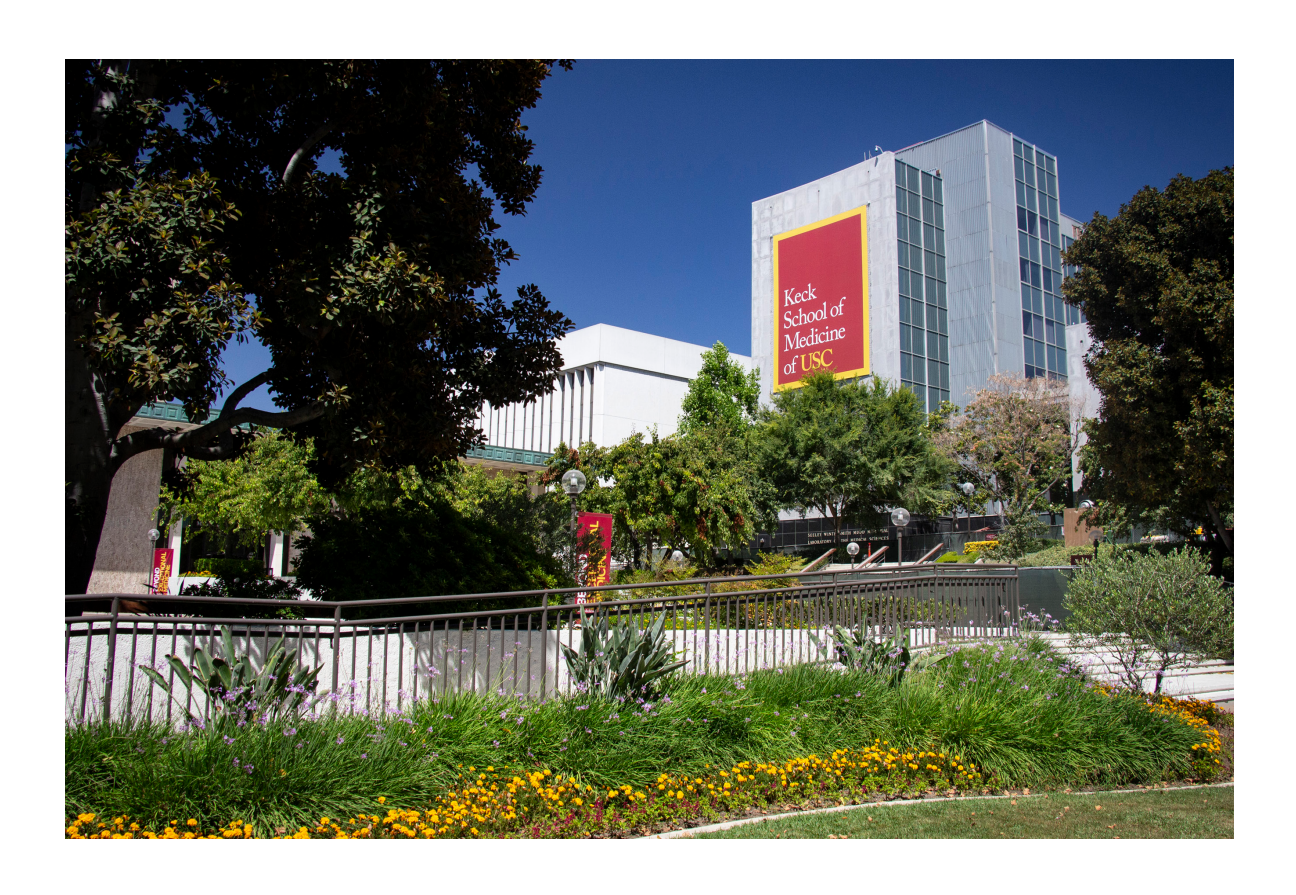
It's your time to shine! Share your photos and best wishes on Twitter, Facebook, and Instagram #KSOMGrad